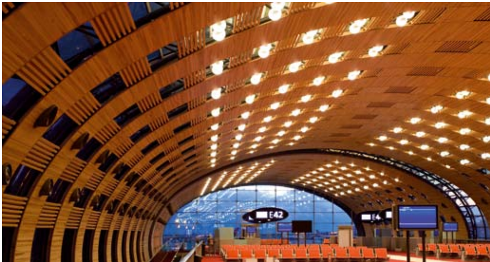
Looking into the depth of the timber cladding building.