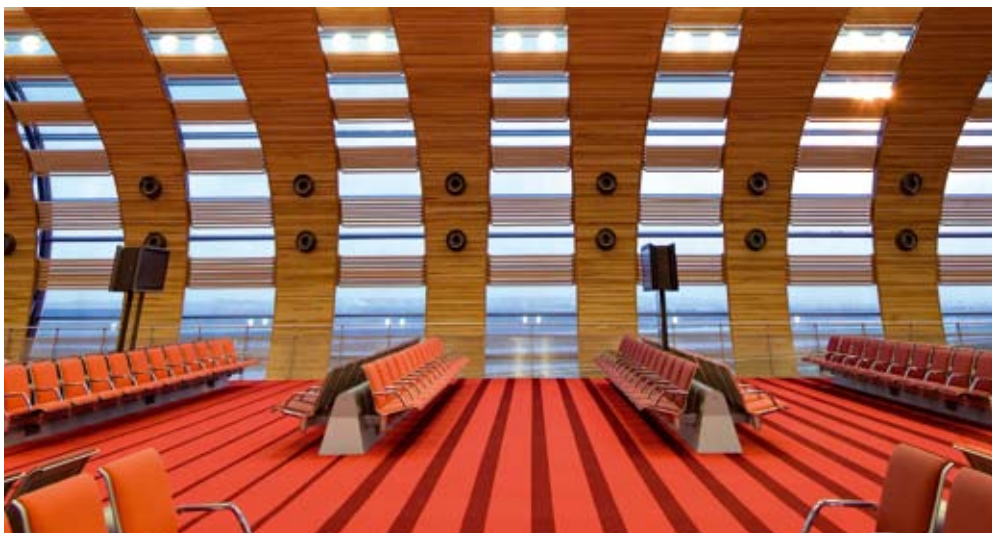
Transverse vaults, slightly tapered.